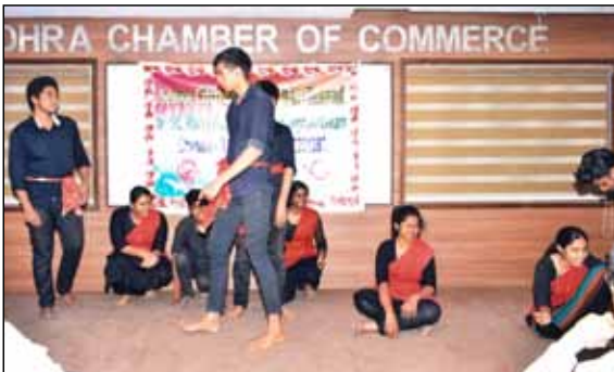
Dance Drama by Students of Madras School Social Work.