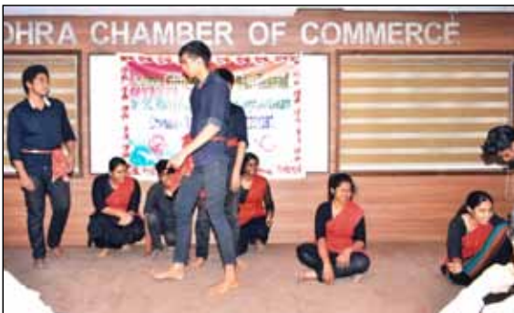
Dance Drama by Students of Madras School Social Work.