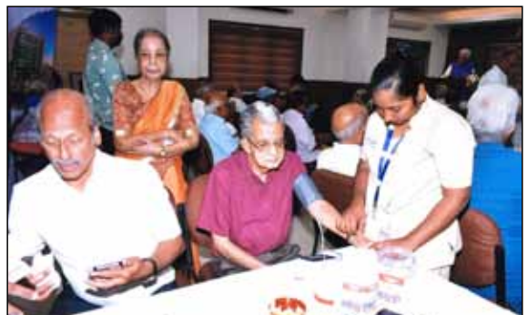
Medical Camb by MGM Hospital, Chennai.