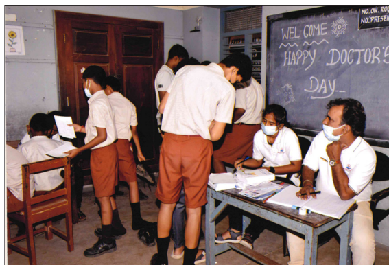
Health Camp by Murugan Hospital in the Students.