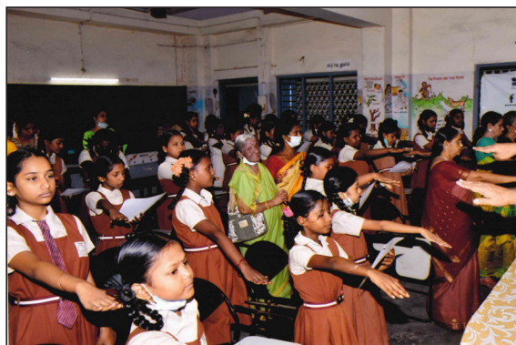
Students taking Oath, against abuse of Elders.

Brief Notes on Event No.240 (Commemoration of world elders Abuse Awareness Day and International Day of Yoga) held on 1st July 2022 at Dr.BMS Higher Secondary School, Shenoy Nagar, Chennai.