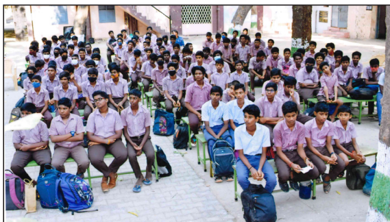
Students took active part in the event.

the event commenced at 3 Pm with prayer song by students. Even though the strength of our members who attended the function was poor, the function went on very well with all the teachers and higher class students.