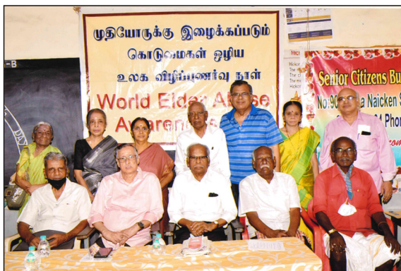
Some of the SCB participants who attended the event.