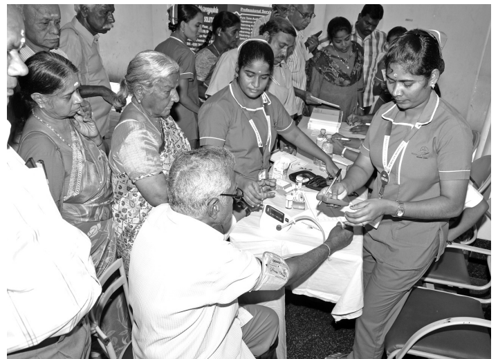
Health Monitoring Test

this multi various tests organised in an orderly manner in different rooms of this popular hospital in Kilpauk, which is growing in strength year by year. Our kudos to them as this the second year they came forward for this type of free camp.